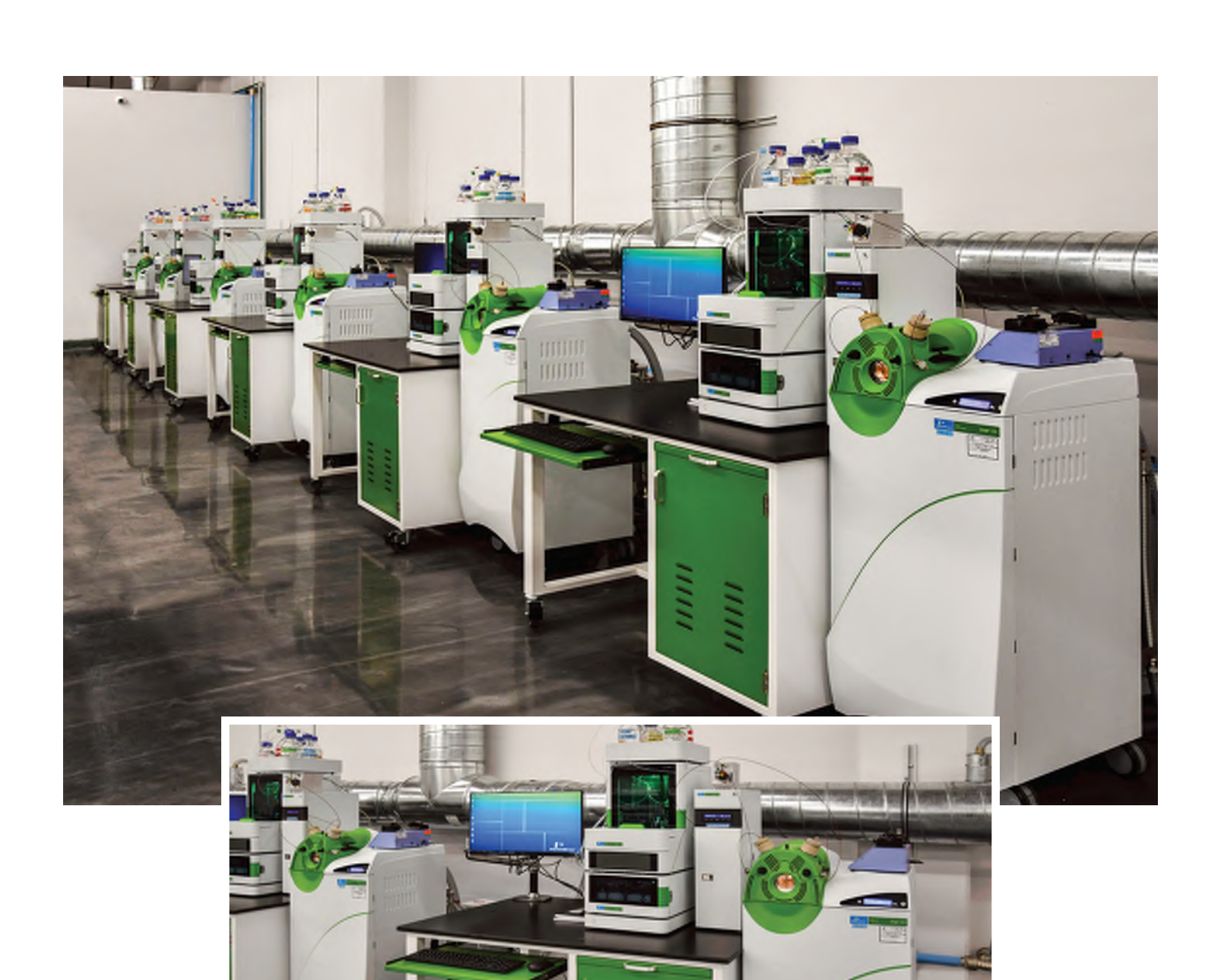
Custom Design – Manufactured mobile cart and cabinetry for instrumentation