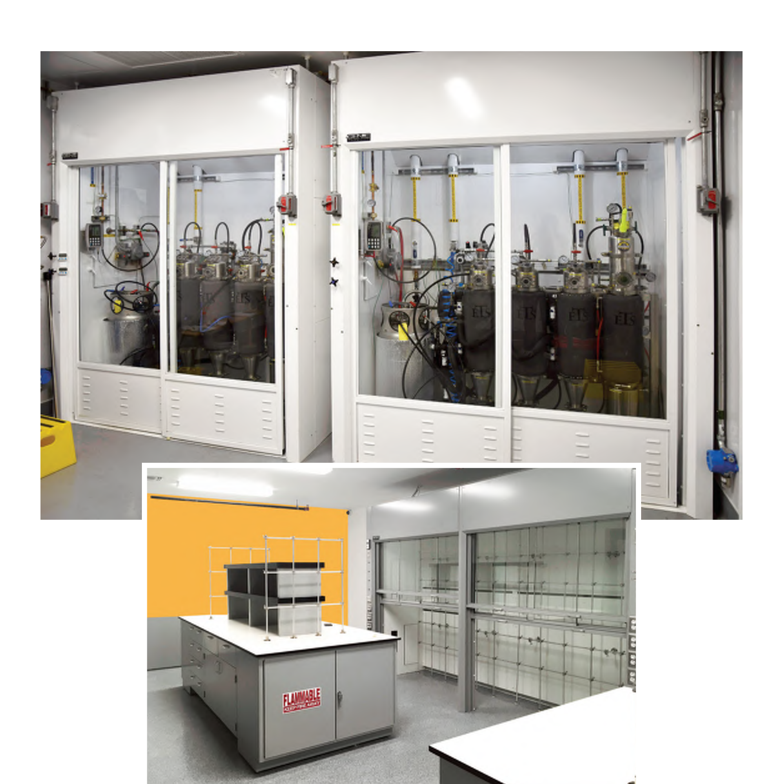
California's first licensed medical cannabis manufacturing & research group —built by Genie Scientific