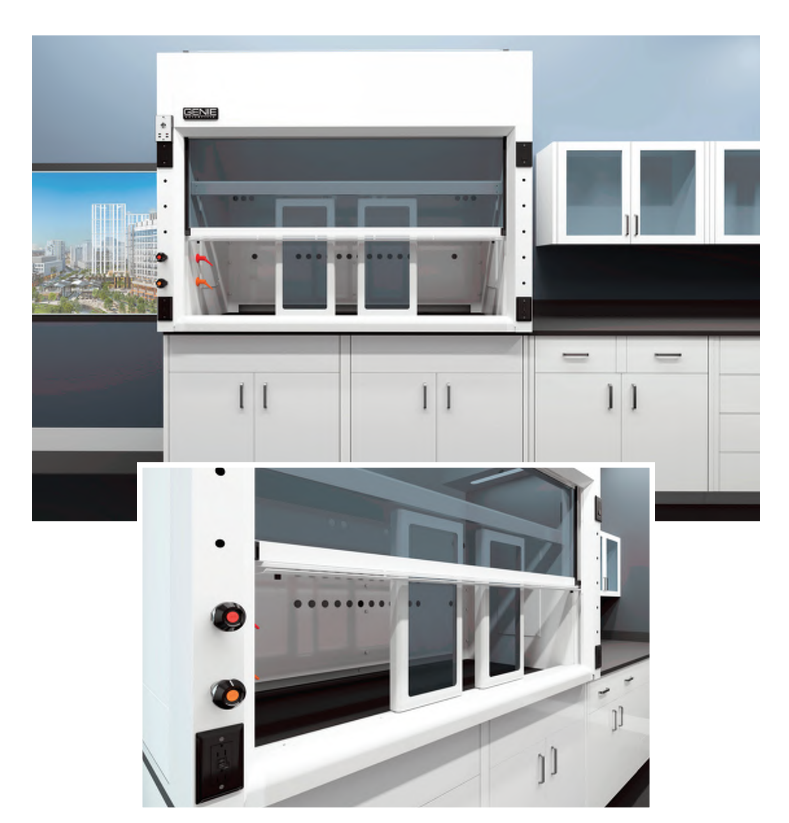
GENIE SAFETY SHIELD/ECO-SAVER Benefits of adding the safety shield to any hood: – increases user protection while testing – reduces total energy cost by as much as 40%