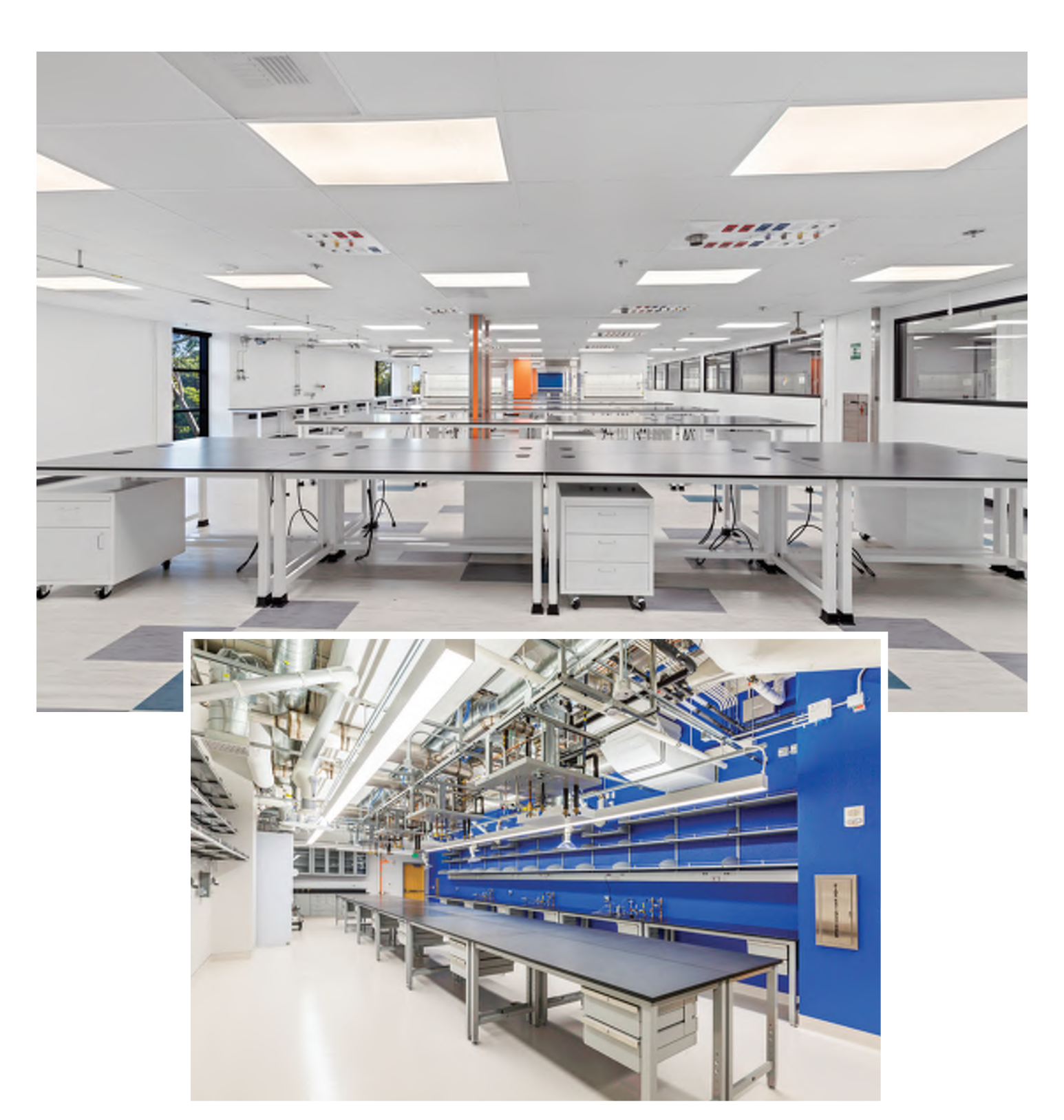
Tables, from simple to complex, available with hanging or mobile cabinets