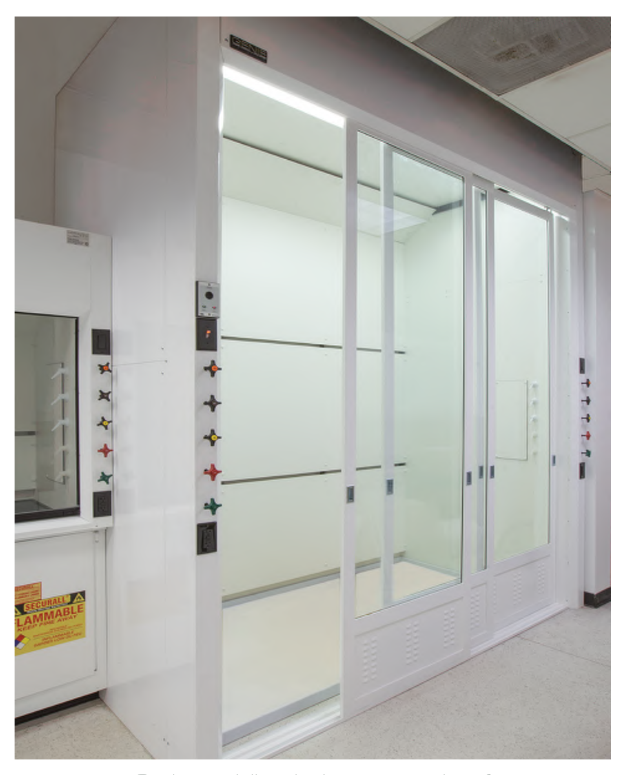
Genie specializes in the construction of mega floor-mounted walk-in fume hoods & enclosures. Custom designed to fit your extractor, reactors or apparatus.