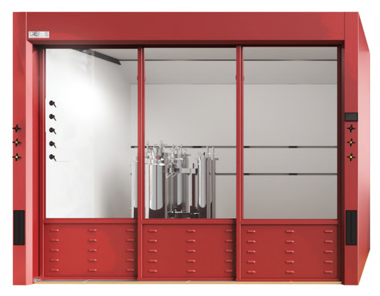
C1/D1 & C1/D2